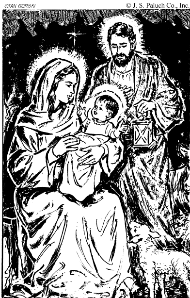
JESVS CHRIST OVR SAVIOR IS BORN

The Parish Deficit Reduction Collection will be taken up at all Masses this weekend.